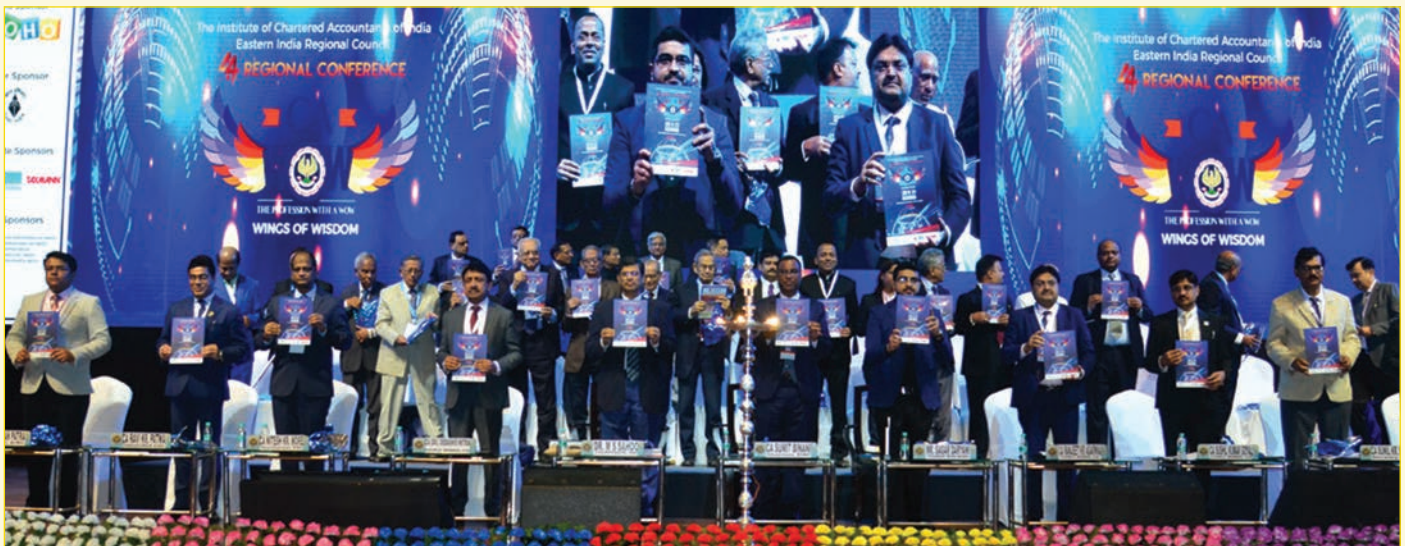
Releasing the Official Souvenir