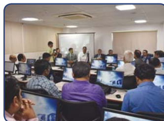
Class at Digital Forensic Lab