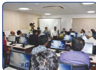
Class at Digital Forensic Lab